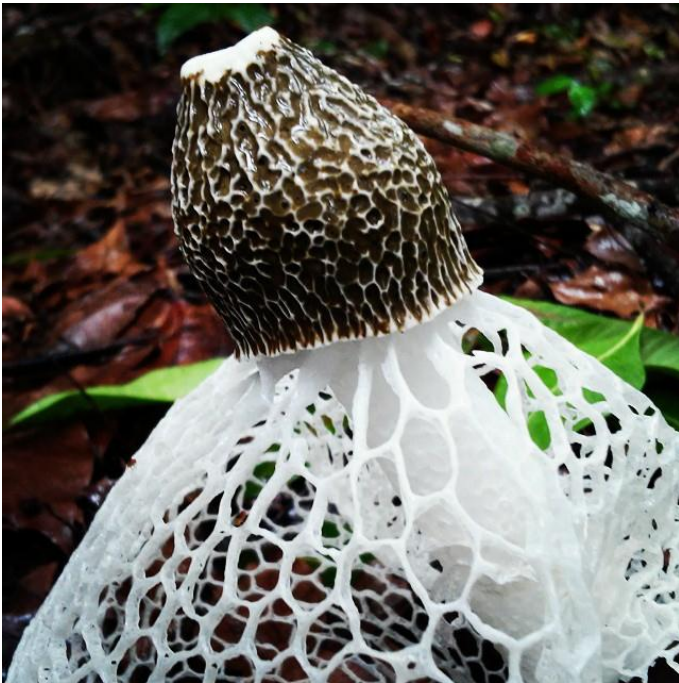
Figure 2. An edible macrofungi from Alas Purwo National Park, Dictyophora indusiata or bamboo fungus

Macrofungi cultivation in Indonesia is relatively advanced compared to other countries such as China, Japan, Taiwan, France, Italy, United States, and others [17]. Currently, around 30 species of edible macrofungi cultivated commercially and only 15 species are produced on an industrial scale [18]. In Indonesia, there are some species of macrofungi that have been known and cultivated, such as Volvariella , Agaricus , Pleurotus , Auricularia , Lentinus , Flammulina , Velutipes , and Grifola [17]. From the tropical rainforest ecosystem of Alas Purwo National Park, it is found that 22 genera have potential for a food source. This fact increased the information about diversity of edible macrofungi which can be cultivated as alternative food sources.